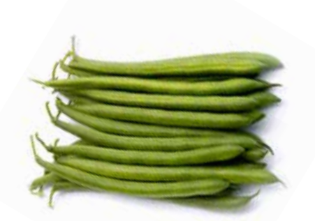
Lunar / PV959 The Magma Collection®