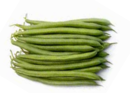
Sanford / PV958 The Magma Collection®

Farmers first choice for growing fresh market beans during the hot season. Uniform pods in sieve size and length.