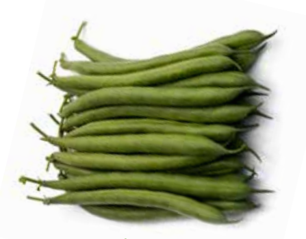
Pelican / PV961 The Magma Collection®

A very sturdy erect plant habit with uniform dark green pods. Specially bred for the fresh market segment under hot growing conditions.